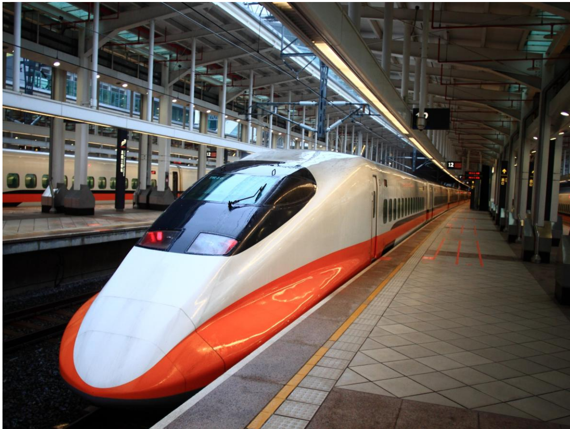
Examples of a modern Maglev train.