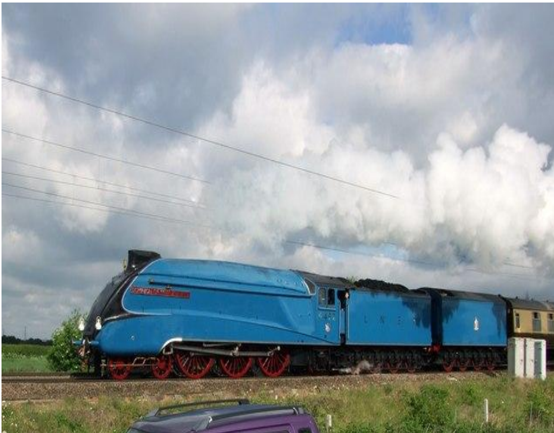
A4 LNER engine - holds the world speed record for steam.

Music printed in this order of service is covered under a music copyright licence agreement: Licensing #604802